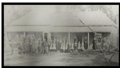
School opened in 1882