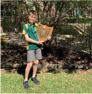
Harley with the Citizenship Shield.