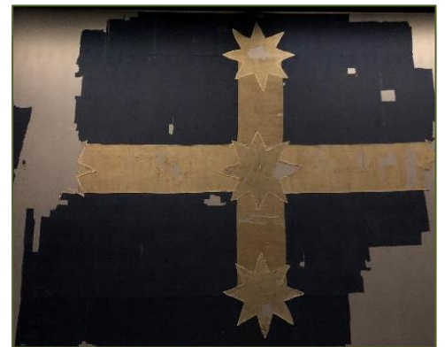
The remaining parts of the original Eureka Flag. Bits were cut off for people who showed interest in the flag for almost 90 years.