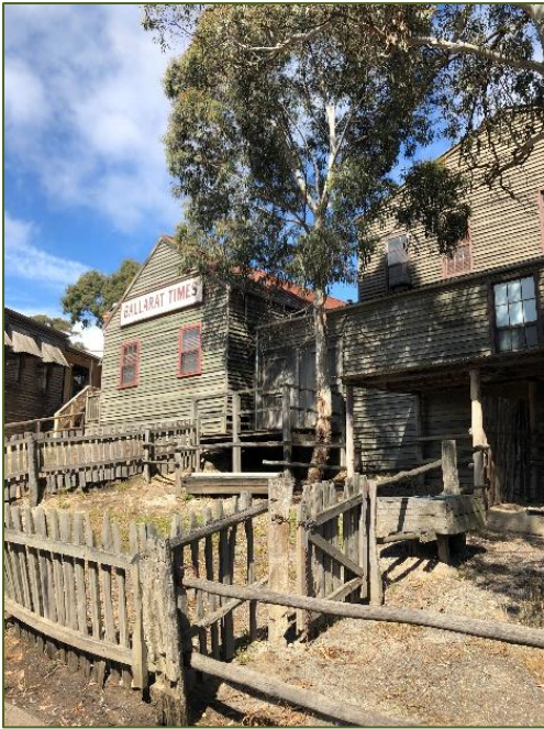
The old buildings at Sovereign Hill