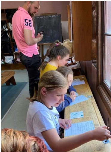
Handwriting with a quill and ink pot