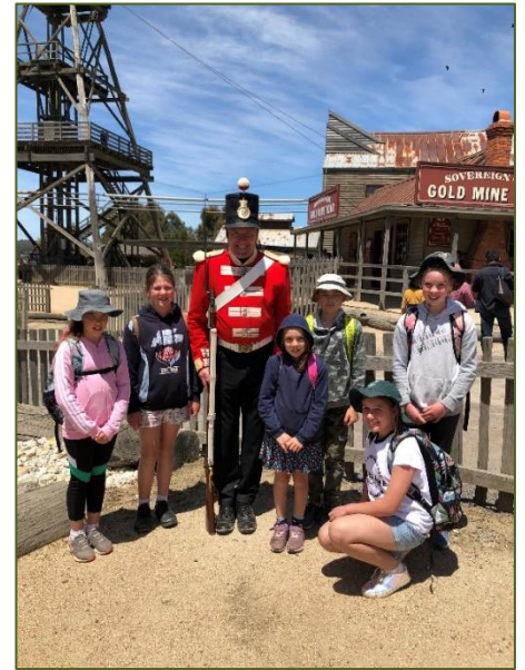
The Red Coat Army put on a parade. We got a photo with one of the soldiers