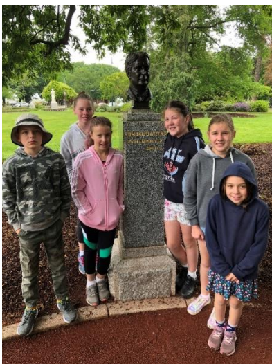
We are pictured with Sir Edmund Barton- Australia's first Prime Minister