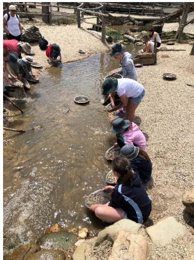
Panning for gold at Sovereign Hill